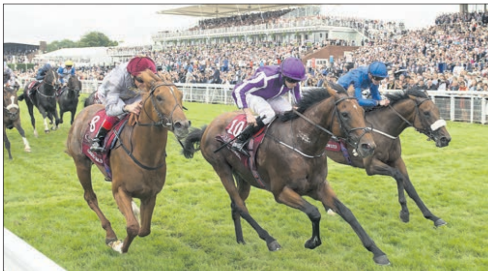
The Gurkha (centre) wins the Sussex Stakes, earning him a Racing Post Rating of 124