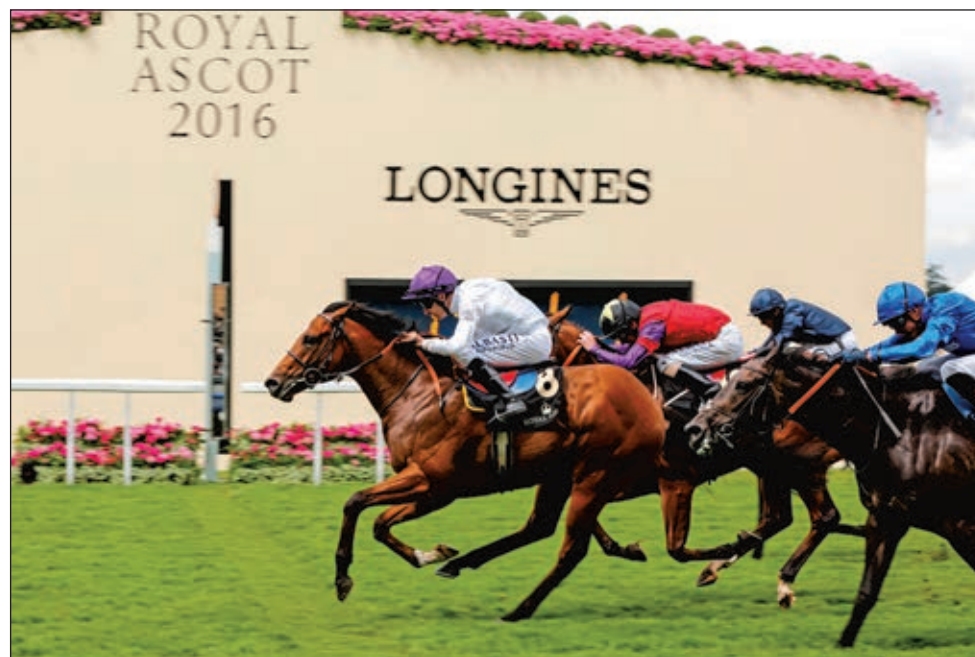
Norfolk Stakes scorer Prince Of Lir is one of four sons of Kodiak retired to stud in 2017