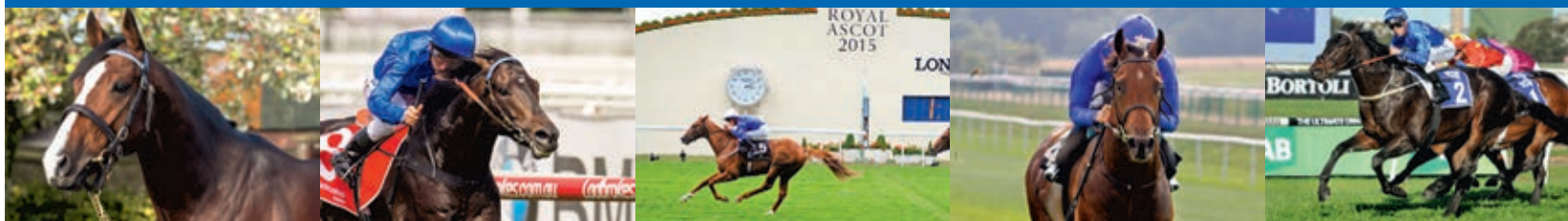
BELARDO BOW CREEK BURATINO CHARMING THOUGHT EXOSPHERE

Sprinters, milers, juveniles, a proven sire and CLUB horses: our nine new stallions for 2017 have many and varied talents. What unites them is the single most essential attribute of the modern racehorse. Speed.