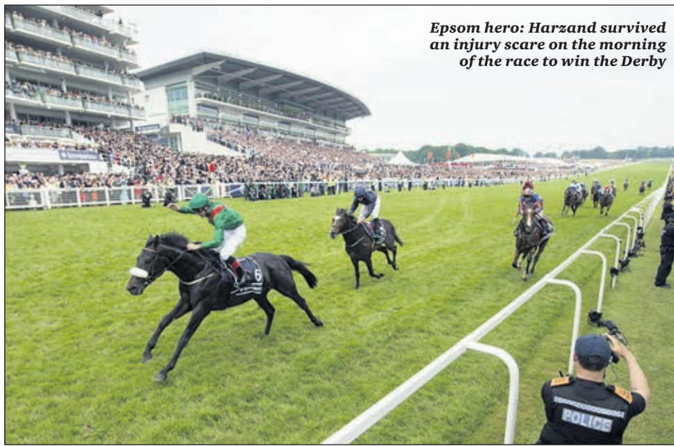
Epsom hero: Harzand survived an injury scare on the morning of the race to win the Derby

An exceptional racehorse, Sea The Stars is shaping into a top-class sire with last season's Group 1 victories achieved by Harzand and Zelzal bringing his tally of Group 1 winners to