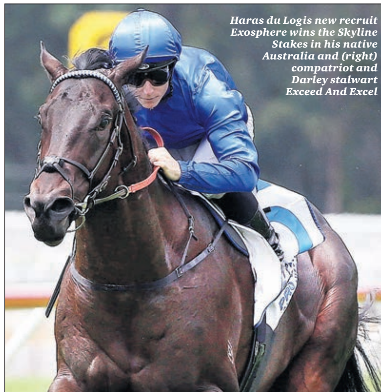
Haras du Logis new recruit Exosphere wins the Skyline Stakes in his native Australia and (right) compatriot and Darley stalwart Exceed And Excel

"He has a wonderful temperament and for a horse