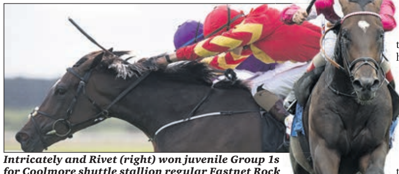
Intricately and Rivet (right) won juvenile Group 1s for Coolmore shuttle stallion regular Fastnet Rock

Beneteau sired just two crops before his death but they have gone on to deliver a hugely respectable ten per cent stakes-winners-to-runners, while Not A Single Doubt and Snitzel sit in second and fourth place respectively in Australia's 2016-17 leading sires' table.