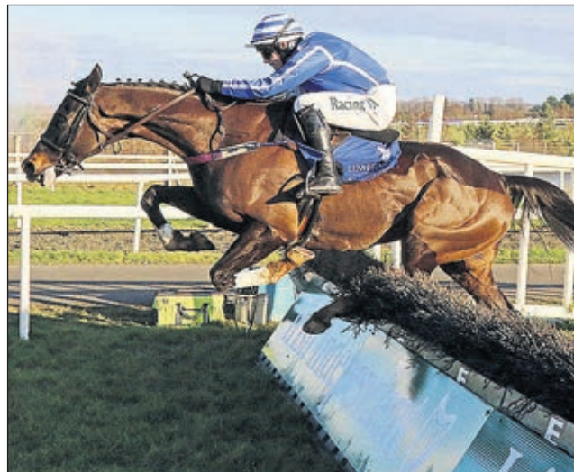
Recent Grade 2 novice hurdle winner Penhill is a son of Boardsmill Stud's new dual-purpose recruit Mount Nelson

The trajectory of Haafhd's stallion career has gone in the opposite direction, having failed to live up to great expectations in his second career, but the son of Alhaarth is a solid source of classy handicappers and stakes performers – as Haafaguinea