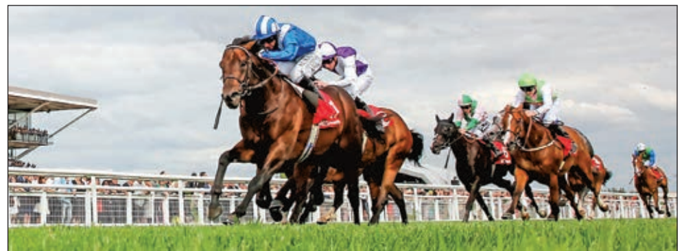
Adaay scores a decisive victory in the Group 2 Hungerford Stakes at Newbury