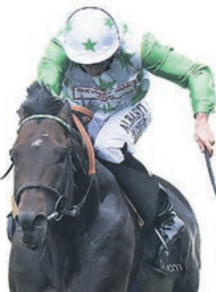
Twilight Son: the dual Group 1 winner was unbeaten in his first five races

After finishing runner-up to champion sprinter Muhaarar on his final three-year-old start in the Champions Sprint, he doubled his Group 1 tally with a thrilling victory in last year's Diamond Jubilee Stakes ahead of Gold-Fun, 2015 winner Undrafted and subsequent top-level victors Signs Of Blessing and The Tin Man.