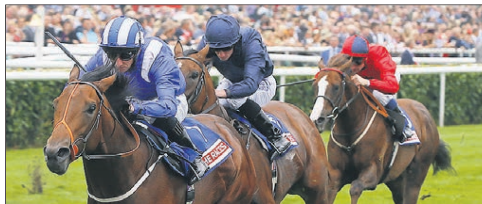
Estidhkaar won three of his five juvenile starts, including the Group 2 Champagne Stakes

That victory proved to be his last, but Buratino ran two fine races in Group 1 company