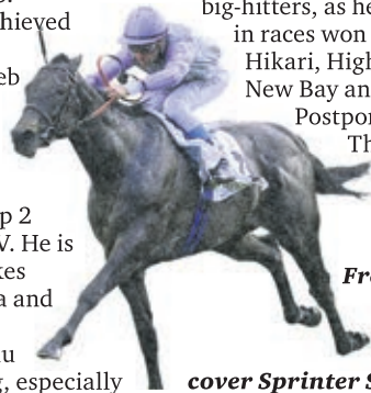
Free Port Lux: Haras de Cercy new boy will cover Sprinter Sacre's dam

Bow Creek achieved the figure for his defeat of Mustajeeb and Gordon Lord Byron in Group 2 company at Leopardstown, one of three Group 2 victories on his CV. He is out of Dahlia Stakes winner Beneventa and his price of just €4,000 at Haras du Logis is appealing, especially