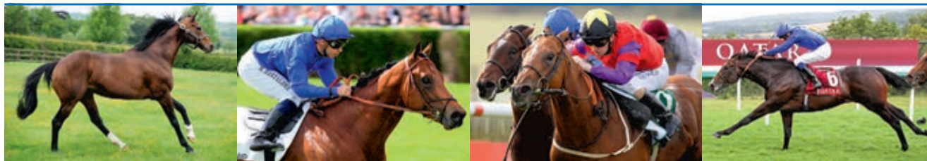
FAST COMPANY TERRITORIES THE LAST LION TOORMORE