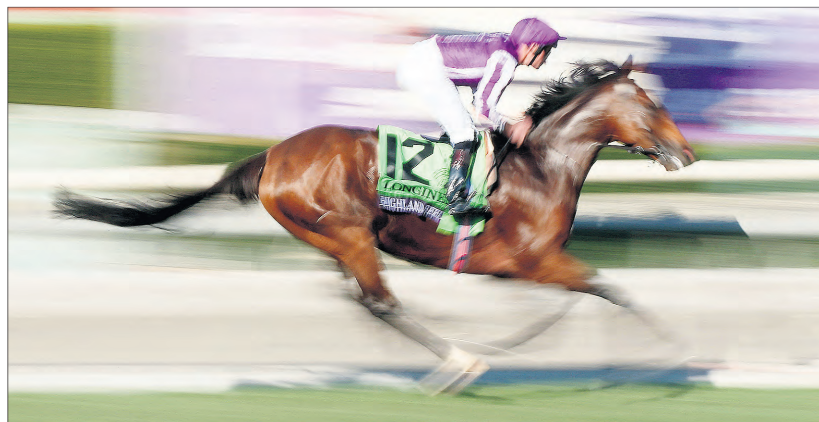
Hveger's boys: Highland Reel, landing the 2016 Breeders' Cup Turf, and his brother Idaho (below), placed in Derbys at both Epsom and the Curragh