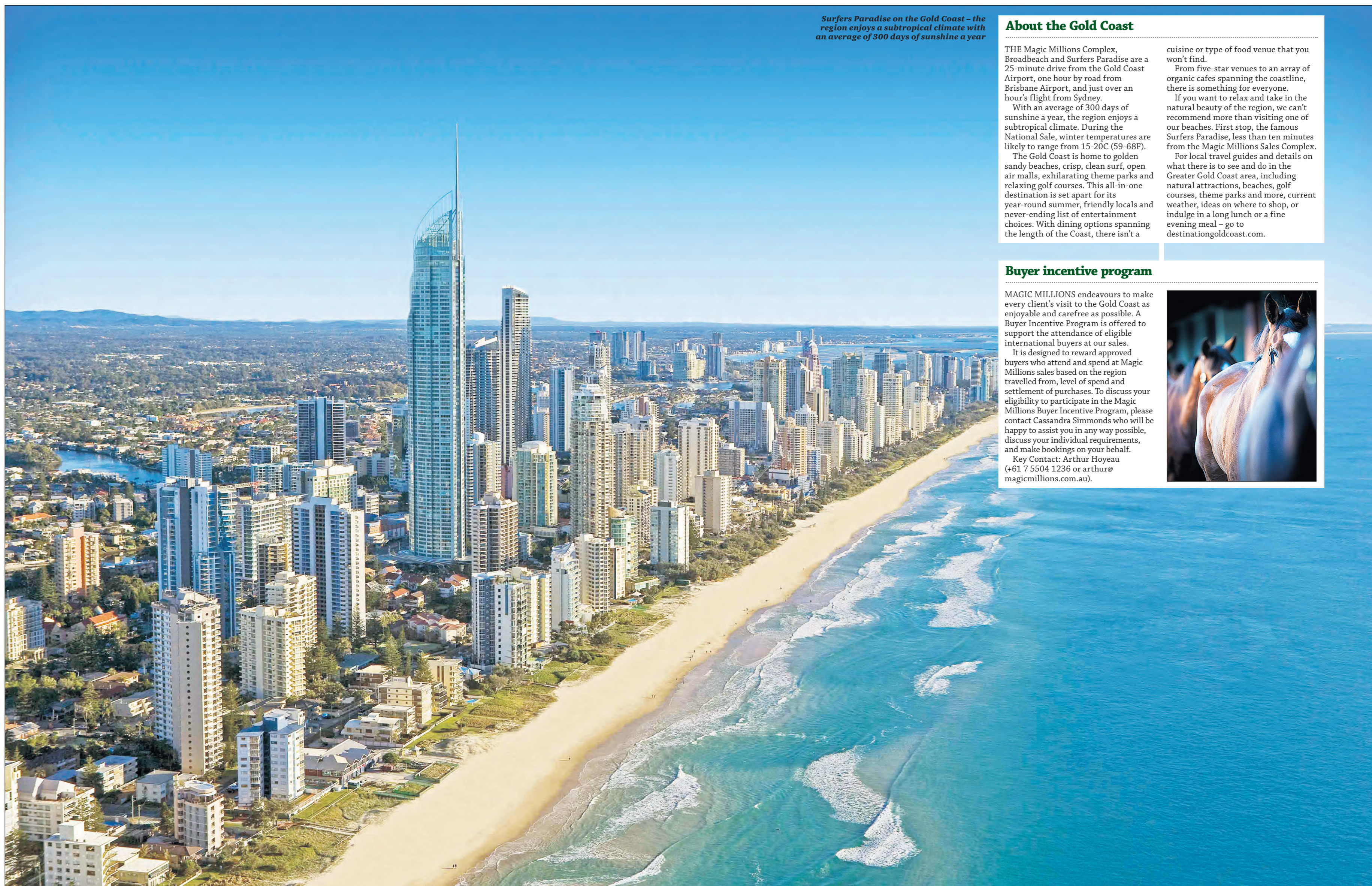
Surfers Paradise on the Gold Coast – the region enjoys a subtropical climate with an average of 300 days of sunshine a year

10-11 Gold Coast lowdown – how to get around, where to stay and where to visit on your trip to Magic Millions