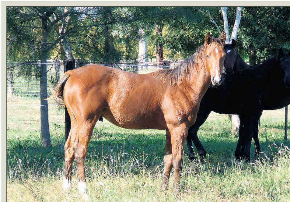
The handsome Medaglia D'Oro colt out of Magic Millions record-breaker Listen Here

Their breeding programmes already feature the privately acquired Group 1 winners King's Rose, More Than Sacred, Moshen and Shamrock. All have