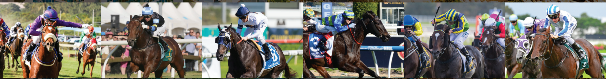
HAPPY VALENTINE GR1 WINNER