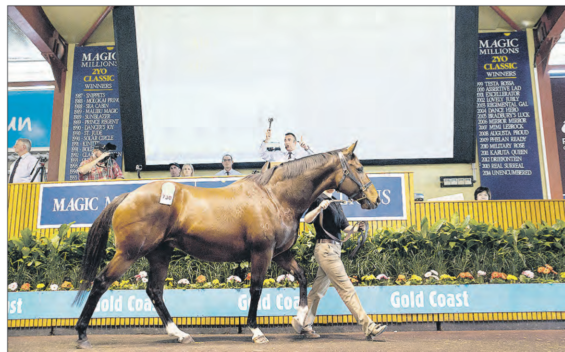
Coolmore bought Monsoon Wedding, carrying to Pierro, for a sale-topping A$2.3m from the Teeley dispersal. She has since been exported to Ireland and in 2016 delivered a son by Galileo; (top right) the mare's brother, star sire Redoute's Choice, and (below) the Group 1-winning Miracles Of Life

The lion's share of his bloodstock portfolio was put up for public auction during that year's Magic Millions