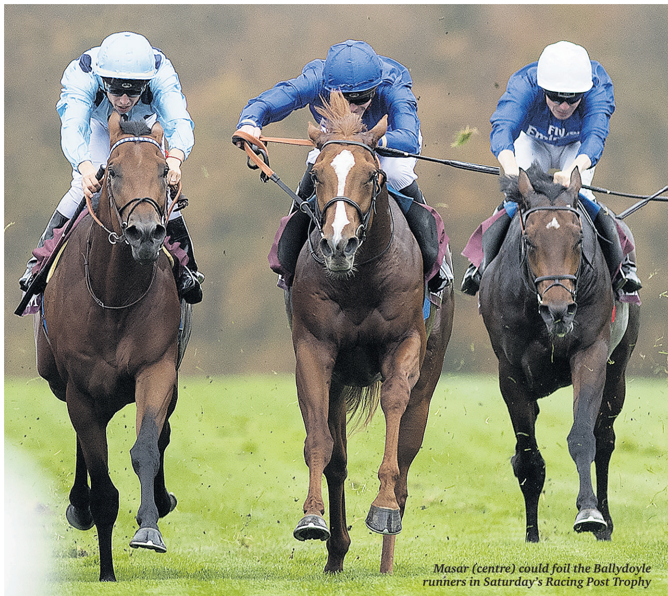
Masar (centre) could foil the Ballydoyle runners in Saturday's Racing Post Trophy

Many had reservations about his effectiveness at the 1m2f