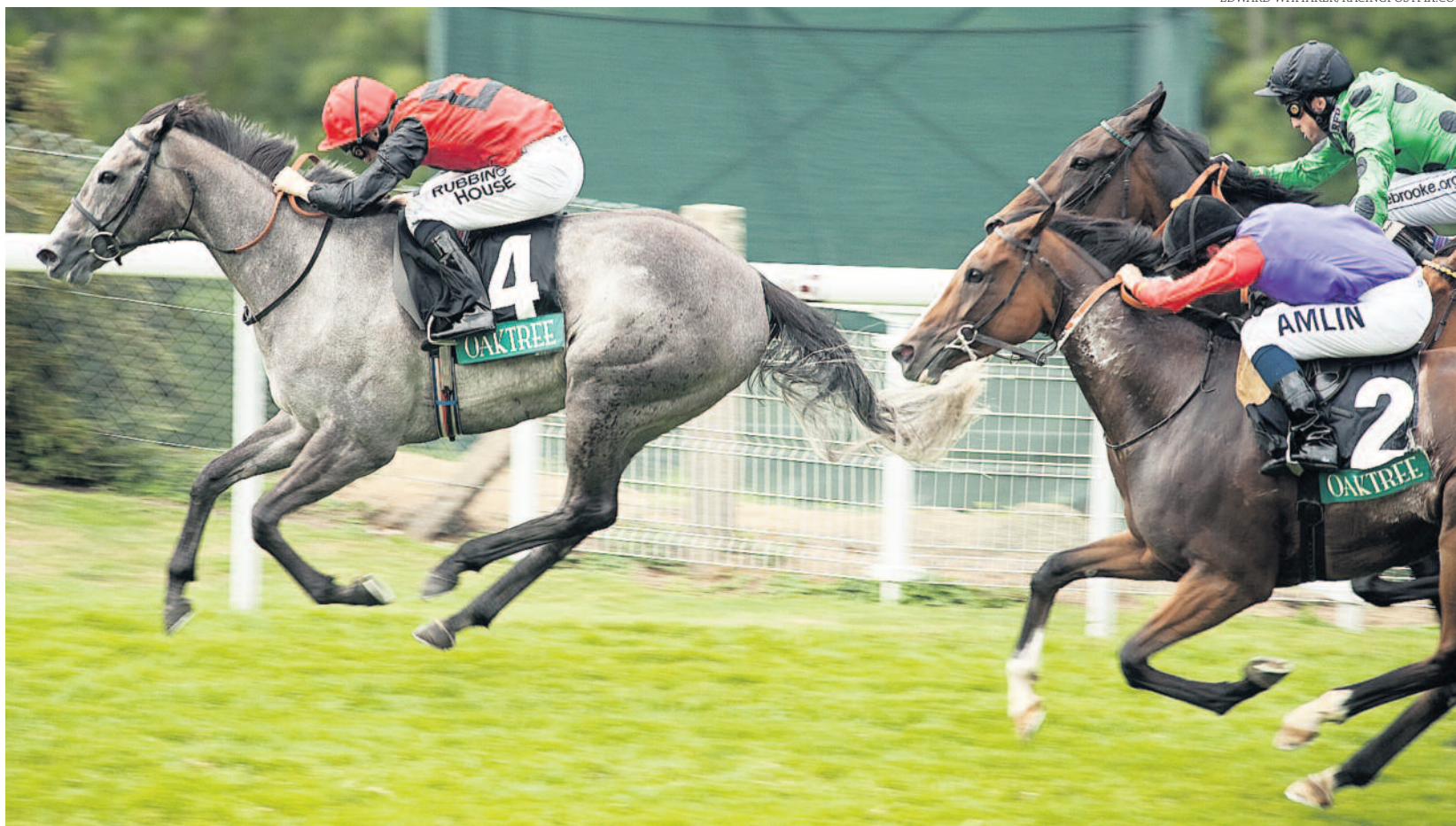
Tropical Paradise and Ian Mongan power away from Golden Stream (No 2) and Pyrrha for victory in the Oak Tree Stakes at Goodwood

"During the foaling season we have a first-class nightwatch person in Alison Thorne as well. It is all about surrounding yourself with good people, especially when you are dealing with people's investment you have to do your absolute best," says Hart.