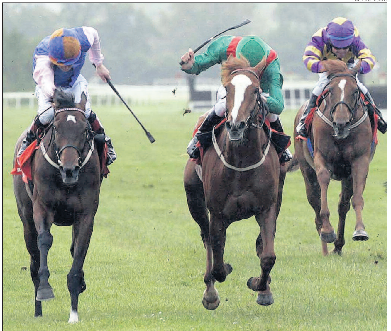
Grace O'Malley (left) gets the better of Karasiyra and company to land her second successive Noblesse Stakes at Cork

Lionne was purchased as a three-year-old for 25,000gns at the 1999 Tattersalls December sale, and has proved a snip, producing six winners from as many foals. Her previous greatest hits were Listed March Stakes winner Jadalee (by Desert Prince) and smart handicapper Coeur De Lionne (by Invincible Spirit). The mare died last year.