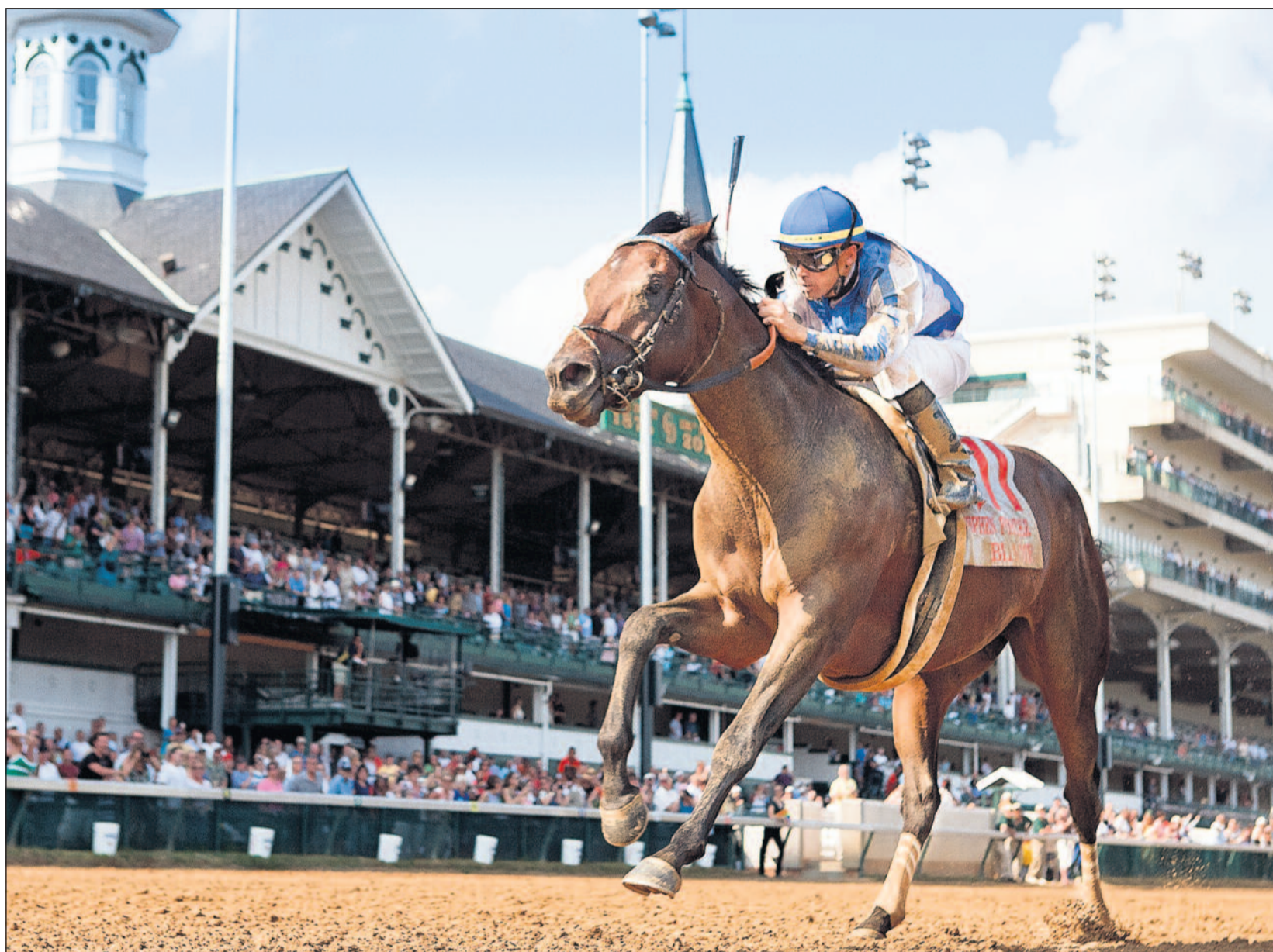
Blame records a first Grade 1 success – and extends his unbeaten run to four – in the Stephen Foster Handicap at Churchill Downs

Although Arch raced solely on dirt – he won five of seven