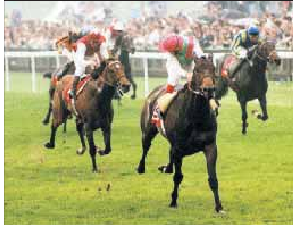
One of Gone West 's best offspring, Zafonic , lands the 1993 2,000 Guineas with ease

There is no doubt that he will be a fixture in prominent pedigrees for decades to come.