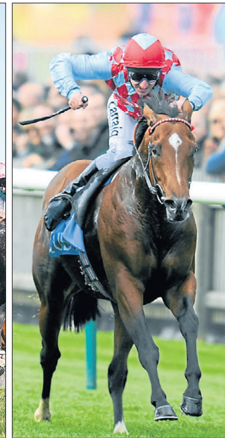
Society Rock (far left) proved a model of consistency during five seasons of racing, winning the Golden Jubilee Stakes and July Cup and twice finishing placed in those Group 1 sprints, and Red Jazz , an equally tough and genuine performer, won or was placed in 20 of his 32 starts

Universal: the son of Dubawi proved a revelation last year and hails from a thriving family