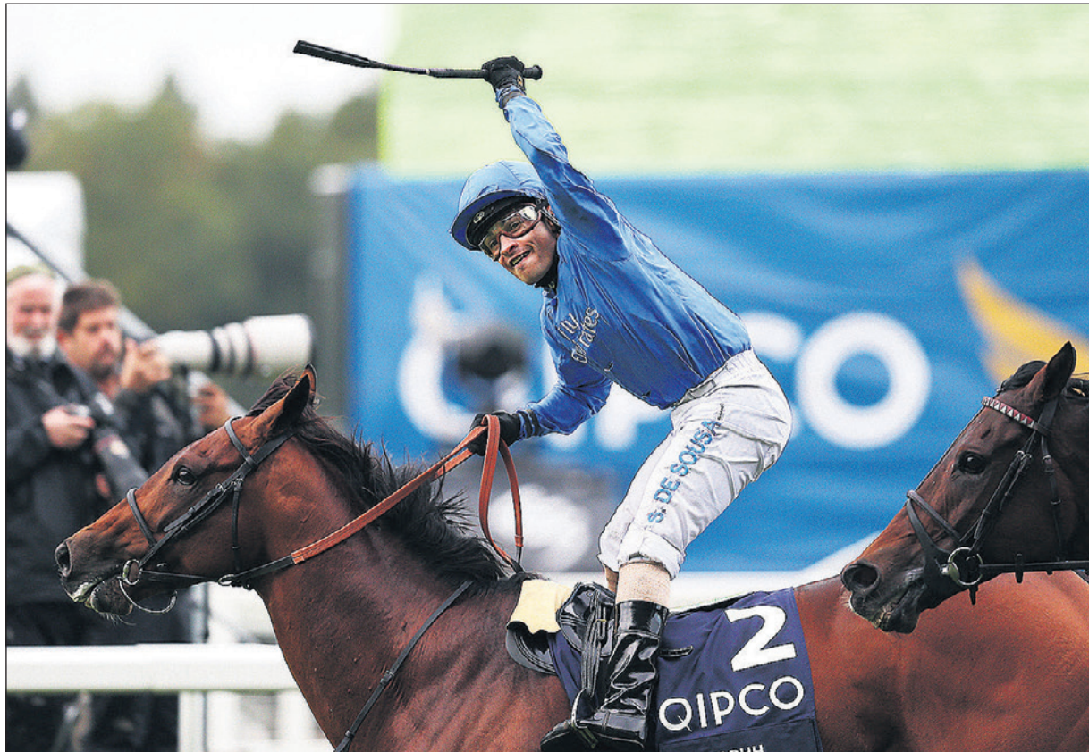
Farhh (above), by Pivotal and who hails from a noted German family, was unbeaten in two Group 1s last season; Havana Gold (top right), the first son of Teofilo to stand at stud, enjoyed his finest hour in the Prix Jean Prat and Imperial Monarch, a Group 1 winner who scored on his debut at two, is closely related to jumps sire Oscar