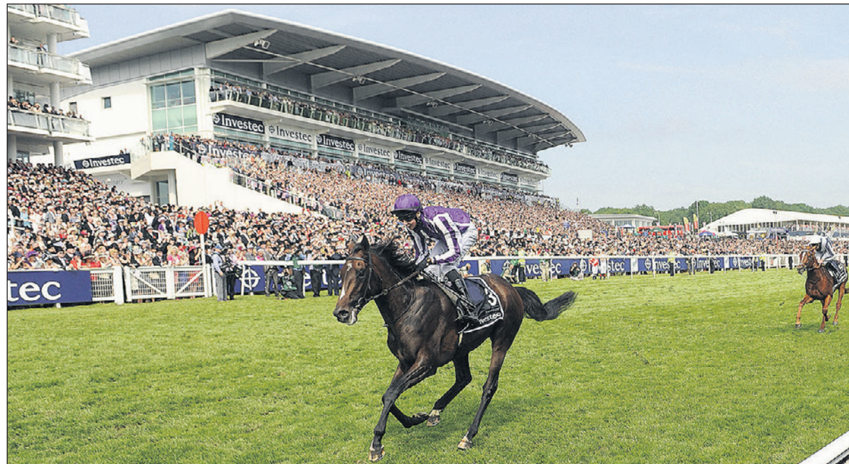
Camelot (above), a son of Montjeu who was a champion at two and three, retires to Coolmore at a fee of £25,000; Dawn Approach (top right) followed up an unbeaten juvenile campaign with a five-length 2,000 Guineas success and Declaration Of War, a dual Group 1 winner, was narrowly denied when signing off at the Breeders' Cup

Pedigree The highest-rated Cityscape: a Selkirk half-brother to Bated Breath whose finest hour came at Meydan