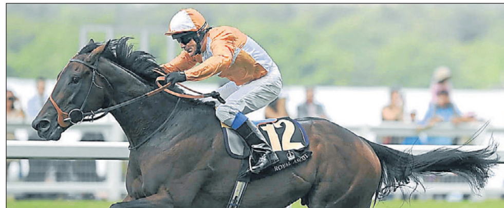
Most Improved (above) enjoyed his finest moment in Royal Ascot's St James's Palace Stakes and Reckless Abandon was a brilliant, unbeaten two-year-old from the family of Storm Cat