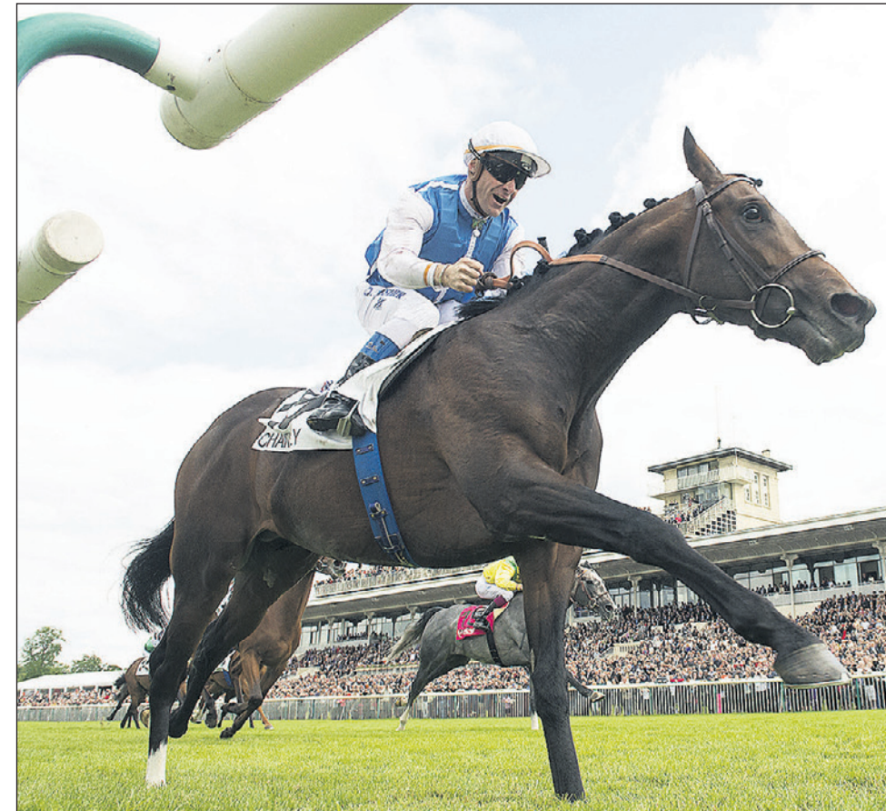
Intello, easy winner of the French Derby, is bred on the famed Galileo-Danehill cross

Pedigree In addition to being closely related to Oscar, Imperial