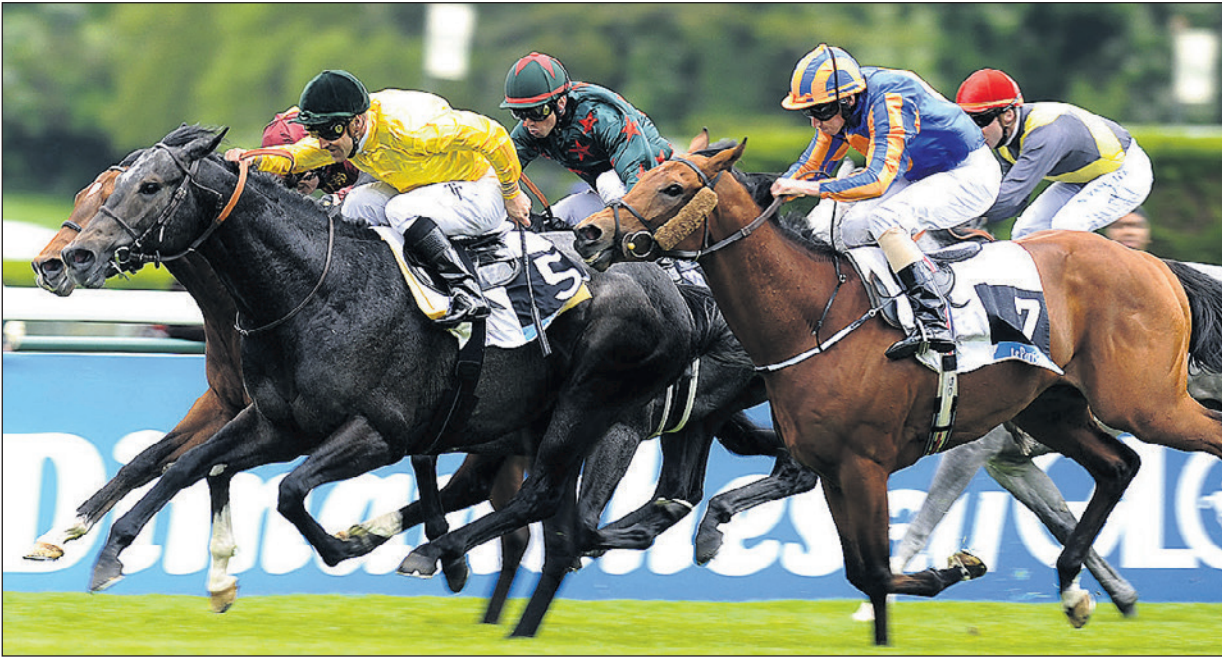
French Classic winners Style Vendome (5, above) and Saonois (top right) will stand in the country of their biggest success. Dabirsim retires to Germany