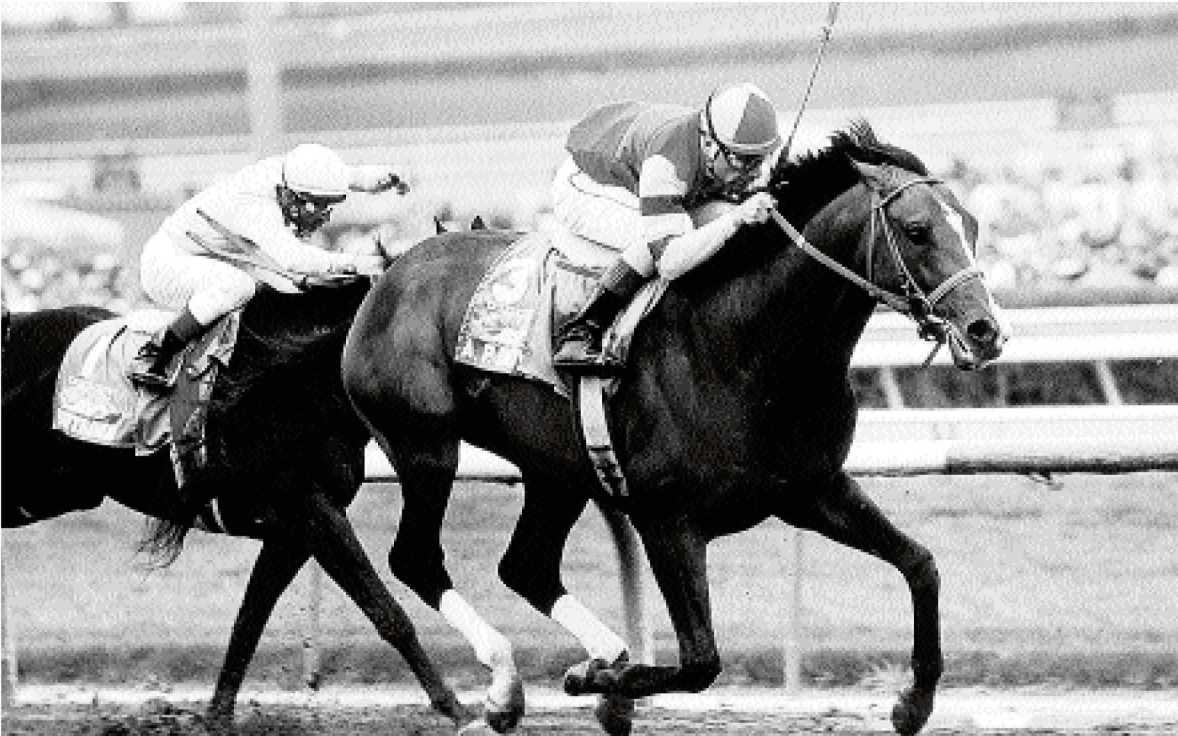
A.P. Indy: Majestic Warrior's sire has produced at least one Grade 1 winner from each of his 12 crops to race

Of course, we have to acknowledge that he is a horse just for the American environment. A number of